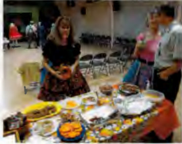
November 7, 2014 FALL COLORS THEME NIGHT